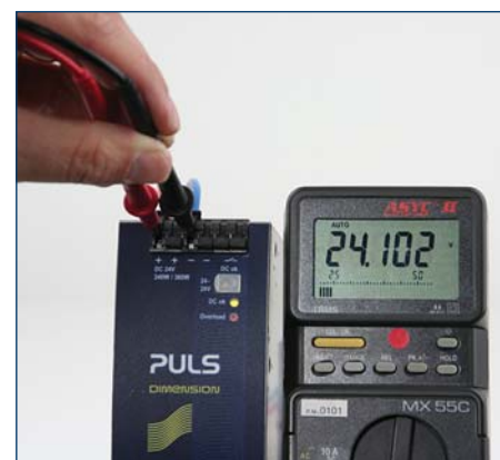
The voltage can be measured from the front when the terminal is closed.