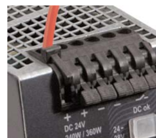
How to use the terminal (shown in open position): Insert wire, flip the lever – ready with a secure and reliable connection.